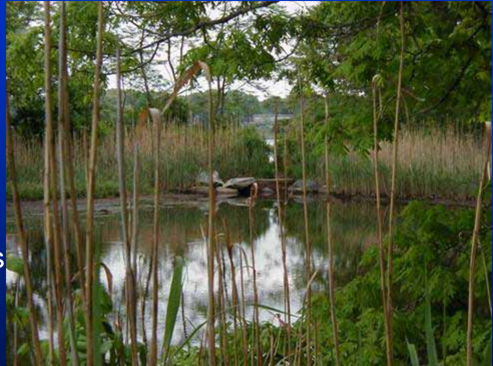
Walkers Farm, RI