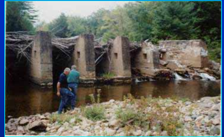
Bearcamp Dam, NH

Coastal America Foundation Fish & Wildlife Foundation