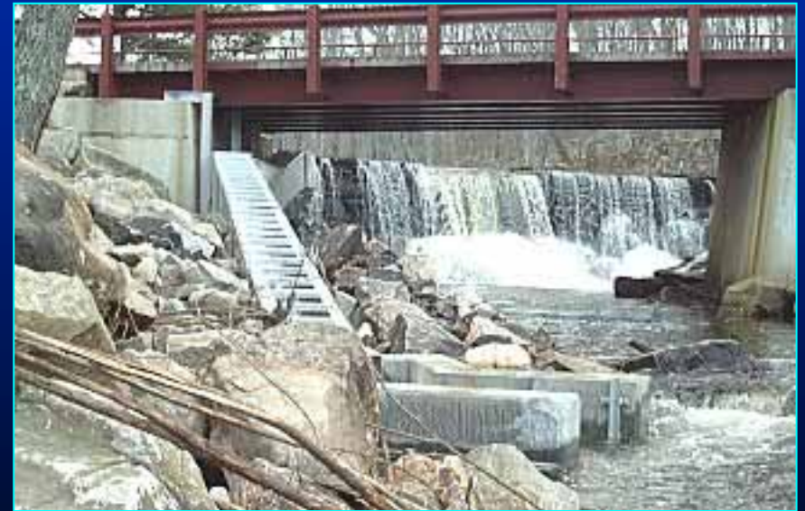
Ed Bills Pond Fish Ladder, CT