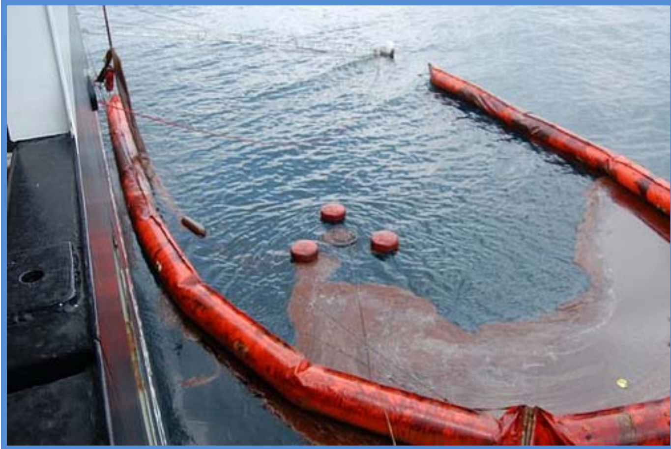
Boom operations in the Gulf of Mexico