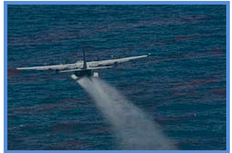
Plane spraying oil dispersant