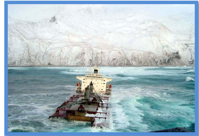
Selendang Ayu, AK