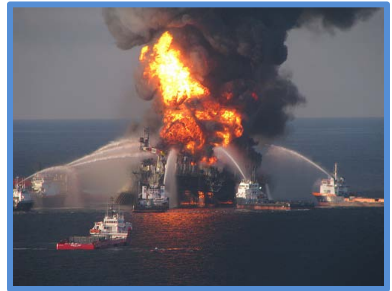
Deepwater oil rig fire