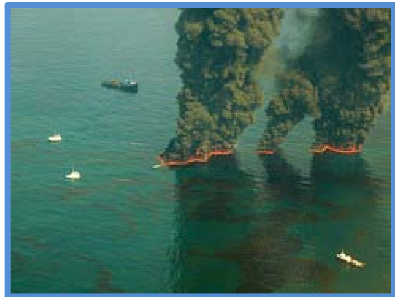
Deepwater controlled burn